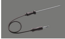
> Weblink 500.000.048.00 / CHF 4.- Core temperature sensor