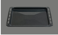
> Weblink 500.000.112.00 / CHF 4.- Multi-purpose baking sheet 30 mm