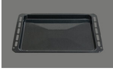
> Weblink 500.000.112.00 / CHF 3.- Multi-purpose baking sheet 30 mm