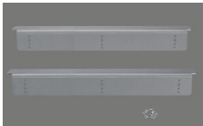
> Weblink 500.000.074.00 / CHF 60.- Set of support brackets