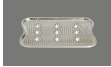
> Weblink 500.000.118.00 / CHF 3.- Cooking container, with holes