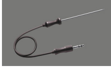
> Weblink 500.000.048.00 / CHF 3.- Core temperature sensor