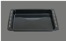
> Weblink 500.000.115.00 / CHF 96.- Extra deep baking sheet 50 mm