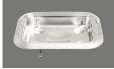
> Weblink 500.000.116.00 / CHF 3.- Cooking container