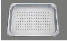
> Weblink 500.000.047.00 / CHF 3.- Cooking container, with holes