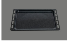
> Weblink 500.000.119.00 / CHF 2.- Baking sheet 20 mm