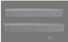
> Weblink 500.000.074.00 / CHF 60.- Set of support brackets