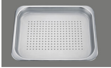
> Weblink 500.000.047.00 / CHF 2.- Cooking container, with holes