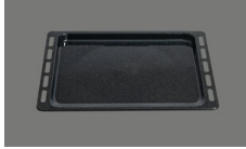
> Weblink 500.000.119.00 / CHF 2.- Baking sheet 20 mm