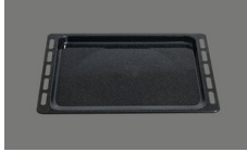
> Weblink 500.000.119.00 / CHF 2.- Baking sheet 20 mm