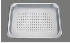
> Weblink 500.000.047.00 / CHF 2.- Cooking container, with holes