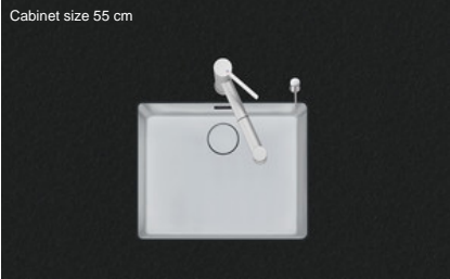
Cabinet size 55 cm

Fitting style Undermount bowls Model DAN 50U Material Stainless steel 18/10 Article no. 10.104.667.00