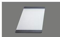
> Weblink 40.000.909.00 / CHF 151.- Chopping board, made of glass, white