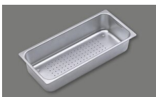
> Weblink 40.000.912.00 / CHF 106.- Colander, perforated