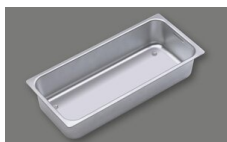
> Weblink 40.001.289.00 / CHF 106.- Colander, unperforated