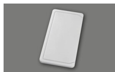
> Weblink 40.001.277.00 / CHF 151.- Chopping board, made of plastic