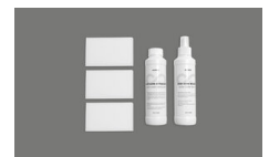
> Weblink 40.001.509.00 / CHF 29.- Easy Care cleaning kit for granite sinks