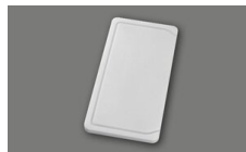
> Weblink 40.001.277.00 / CHF 151.- Chopping board, made of plastic