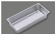
> Weblink 40.001.289.00 / CHF 106.- Colander, unperforated