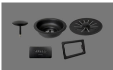
> Weblink 40.002.560.00 / CHF 319.- 3 ½" Space saving, type S | Matte black