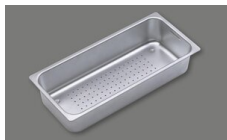
> Weblink 40.000.912.00 / CHF 106.- Colander, perforated