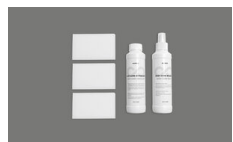
> Weblink 40.001.509.00 / CHF 29.- Easy Care cleaning kit for granite sinks