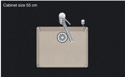
Cabinet size 55 cm

Fitting style Undermount bowls Model DAN CP 50U/2 Material Cristalite Plus Article no. 10.104.784.00