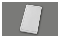
> Weblink 40.001.277.00 / CHF 151.- Chopping board, made of plastic