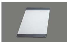
> Weblink 40.000.909.00 / CHF 151.- Chopping board, made of glass, white