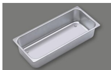
> Weblink 40.001.289.00 / CHF 106.- Colander, unperforated