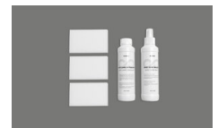
> Weblink 40.001.509.00 / CHF 29.- Easy Care cleaning kit for granite sinks