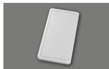
> Weblink 40.001.277.00 / CHF 151.- Chopping board, made of plastic