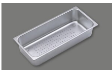
> Weblink 40.000.912.00 / CHF 106.- Colander, perforated