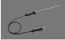
> Weblink 500.000.173.00 / CHF 4.- Core temperature sensor