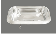
> Weblink 500.000.116.00 / CHF 4.- Cooking container