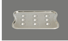
> Weblink 500.000.118.00 / CHF 4.- Cooking container, with holes