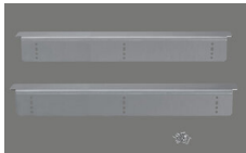
> Weblink 500.000.074.00 / CHF 60.- Set of support brackets