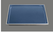
> Weblink 500.000.046.00 / CHF 4.- Cooking chamber divider