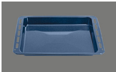
> Weblink 500.000.040.00 / CHF 88.- Extra deep baking sheet 50 mm