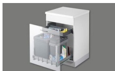
> Weblink 40.001.024.00 / CHF 427.- Müllex Boxx 55/60-R Bio