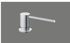
> Weblink 40.001.314.00 / CHF 155.- Dispenser Nano