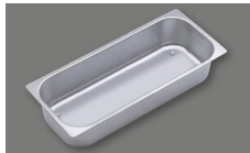
> Weblink 40.001.290.00 / CHF 106.- Colander, unperforated