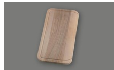
> Weblink 40.001.147.00 / CHF 151.- Chopping board, made of wood