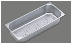
> Weblink 40.000.914.00 / CHF 106.- Colander, perforated