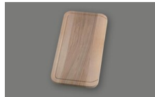
> Weblink 40.001.147.00 / CHF 151.- Chopping board, made of wood