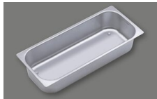
> Weblink 40.001.290.00 / CHF 106.- Colander, unperforated