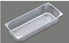
> Weblink 40.000.914.00 / CHF 106.- Colander, perforated