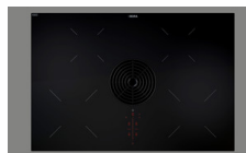
40.002.065.00 / CHF 2713.- BORA Pure PURA