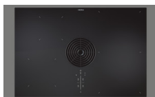
40.002.760.00 / CHF 3234.- BORA M Pure PURMU