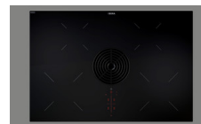
40.002.066.00 / CHF 2879.- BORA Pure PURU