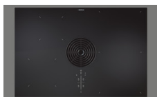
40.002.759.00 / CHF 3068.- BORA M Pure PURMA